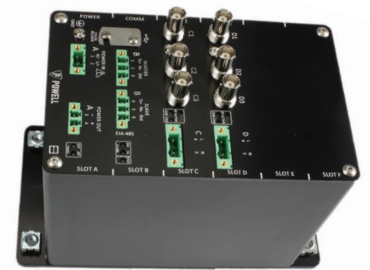
PinPoint Sentry Control Unit